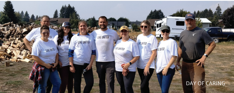
DAY OF CARING

United Way fights for the health, education, and financial stability of every person in every North Idaho community.